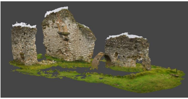
Ruins of Calceby church