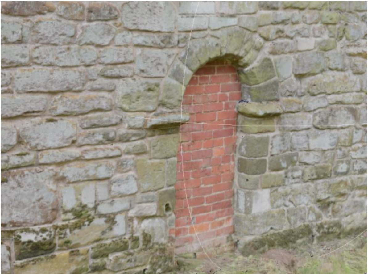
Sutterby church north door - Geoff

Well done Jim for persevering with us it cannot be easy at times .