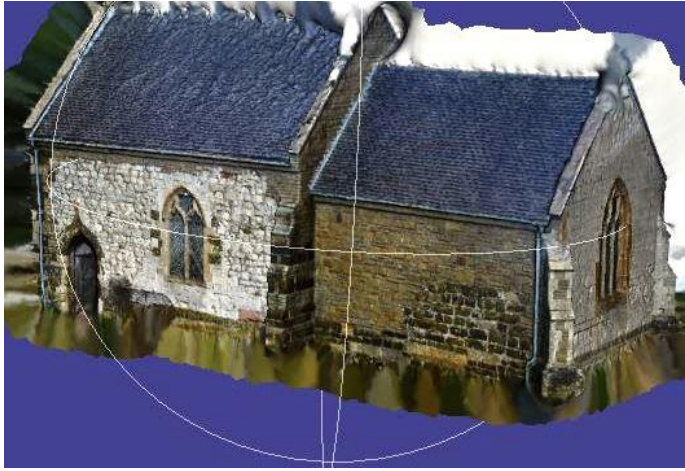
Haugh church exterior and memorial - Mick